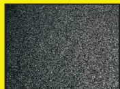
PRESTONE Driveway Heat